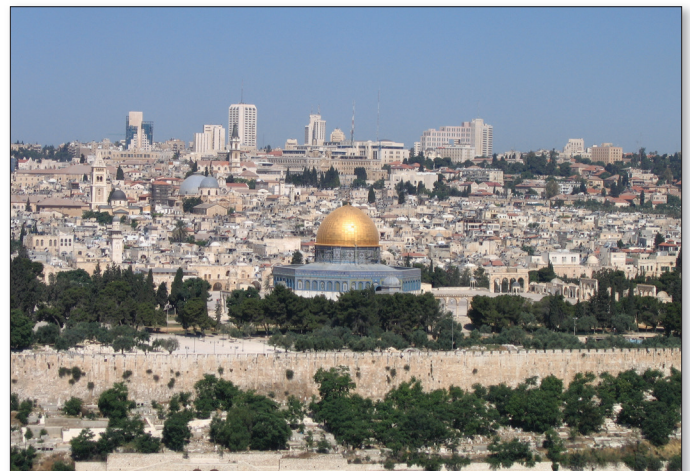
Temple Mount, viewed from the Mount of Olives