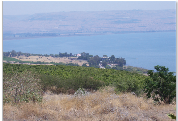
Sea of Galilee, viewed from the Mount of Beatitudes