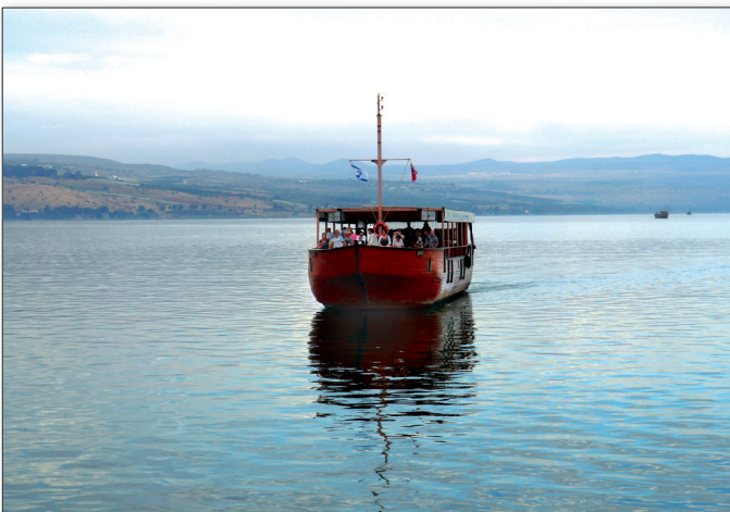
Boat Ride and Fellowship on the Sea of Galilee