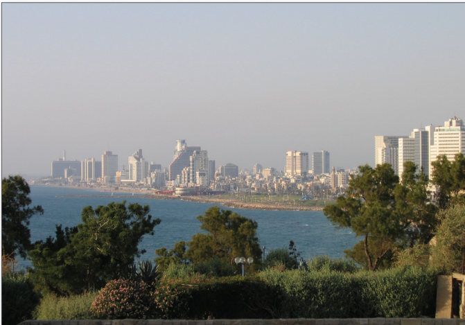
Tel Aviv, from the ancient port of Jaffa

“And now here we are, standing in your gates, O Jerusalem.” (Psalm 122:2)